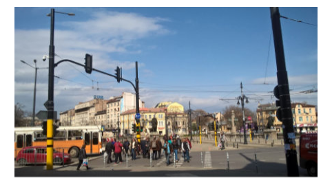
Sofia, Bulgaria Traffic management system with priority for public transport and emergency vehicles

Traffic management system with priority for public transport