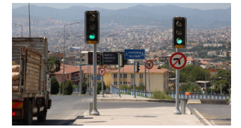
Izmir, Turkey Fully equipped traffic control centre