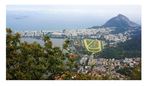
Niterói, Brazil Traffic management system