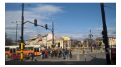
Sofia, Bulgaria Traffic management system with priority for public transport and emergency vehicles

Traffic management system with priority for public transport