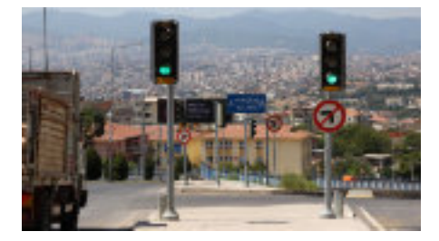
Izmir, Turkey Fully equipped traffic control centre