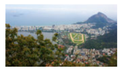
Niterói, Brazil Traffic management system